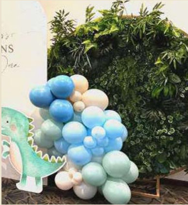
GREEN WALL / 150.0