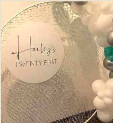
WHITE MESH WALL / 100.0 ACRYLIC SIGNAGE / 60.0 hire only