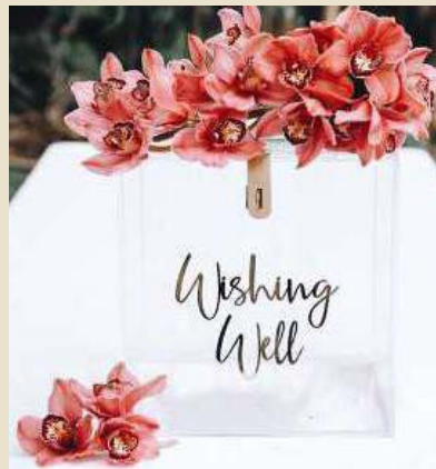
CLEAR WISHING WELL / 40.0