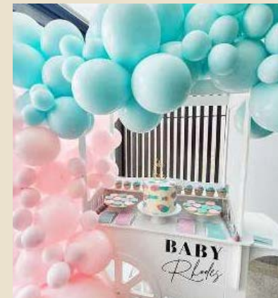
CANDY CART / 150.0