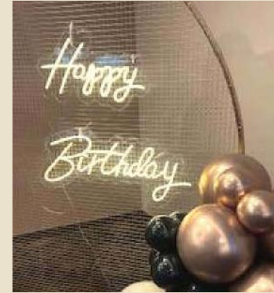
HAPPY BDAY LED SIGN / 50.0