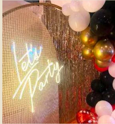
LET'S PARTY LED SIGN / 50.0