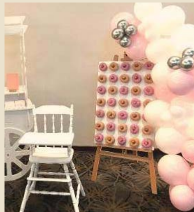
WHITE DECORATIVE HIGH CHAIR / 40.0 DONUT WALL / 50.0