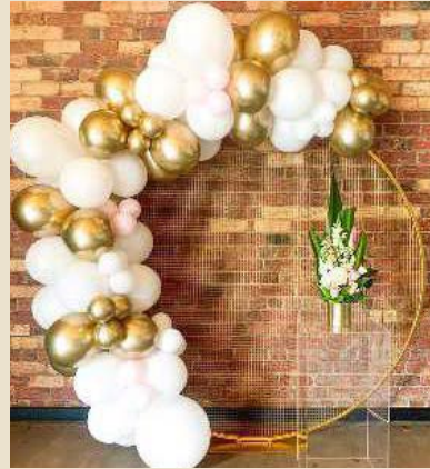
GOLD MESH WALL / 100.0